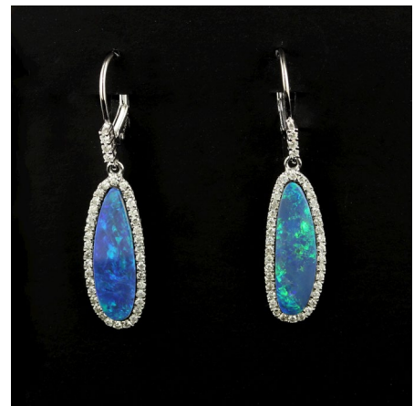
Opal Earrings with Diamonds (Retail $1,580, MSE0788)