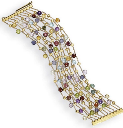
Marco Bicego Paradise Multi Row Bracelet (Retail $8,470, MSB0205)

Interesting on its own and a wonderful contrast for other hues, PANTONE 18-1438 Marsala serves as the foundation to the Spring/Summer 2015 palette. Sensual and bold, delicious Marsala is a daringly inviting tone that nurtures; exuding confidence and stability while feeding the body, mind and soul. Much like the fortified wine that gives Marsala its name, this robust shade incorporates the warmth and richness of a tastefully fulfilling meal, while its grounding red-brown roots point to a sophisticated, natural earthiness.