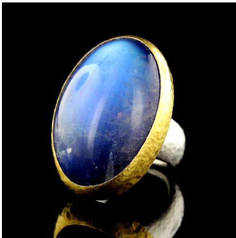
Gurhan One Of A Kind Blue Moonstone Ring (Retail $4,925, SSR2518 )