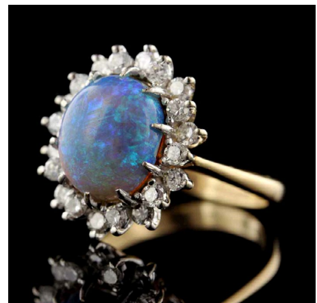
Two Tone Gold Black Opal & Diamond Ring (Our Price: $3,850, ESRG3425)