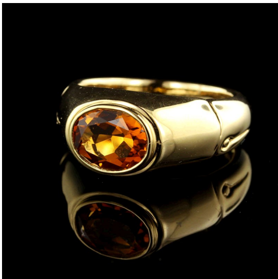
John Hardy Bamboo Signet Madeira Citrine Ring (Retail $700, CIT0451)

Bringing balance to the coolness of the Spring/Summer 2015 color range is PANTONE 14-1213 Toasted Almond. A sun-tanned neutral, Toasted Almond offers comforting warmth and is indicative of a spontaneous spring, summer feeling. Timeless and versatile, Toasted Almond is an organic shade that speaks to authenticity and all that is natural.