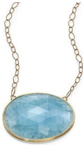
Marco Bicego Rose Cut Cushion Dark Acquamarine (Retail $2,670, AQP0057)

The lead color for women for the Spring/Summer 2015 season, PANTONE 14-4313 Aquamarine is an airy blue with a dreamy feel. Cool and calming, ethereal Aquamarine is a shade with a watery feel. Open and expansive, this restful blue also acts as a stress reducer.