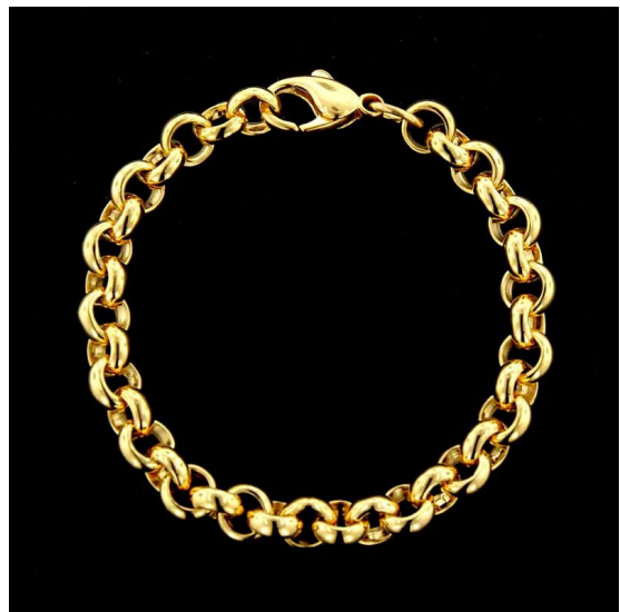
Gold Rolo Chain Bracelet with Lobster Claw (Retail $4,900, LBF4091)