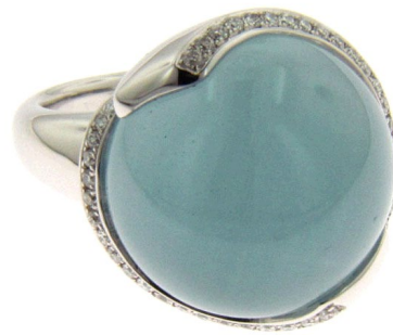
White Gold Aqua Carbon Ring w/Diamonds (Retail $5,250, AQD0294)