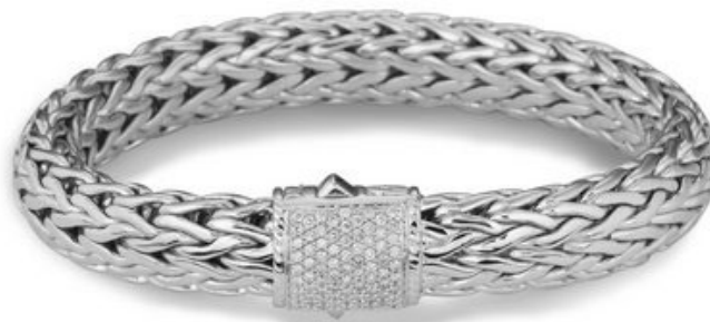
John Hardy Chain Bracelet with Pave Clasp (Retail $2,495, SSB1098)