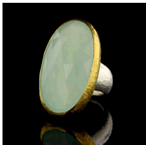
Gurhan One Of A Kind Green Moonstone Ring (Retail $1,300, SSR2519)