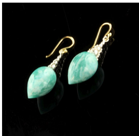
Granule Topped Groovy Green Chickpea Earrings (Retail $350, MSE0934)

Generally not thought of as a fashion color, though it does come back from time to time, PANTONE 14-5714 Lucite Green is a soothing green shade whose time has really come again. Fresh and clarifying, cool and refreshing, Lucite Green has a minty glow. Light in weight and also in tone, Lucite Green seems almost transparent.