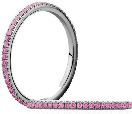
Pink Sapphire Eternity Band (Retail $895, DETS0585)

Aptly named, PANTONE 16-1720 Strawberry Ice is suggestive of a cooling and refreshing delicacy, yet its warmth as a color is quite appealing. Subtle and charming, Strawberry Ice is an ideal shade for Spring/Summer 2015. Both tasty and tasteful, Strawberry Ice is a confection color that evokes a feeling of being “in the pink,” emitting a flattering and healthy glow.