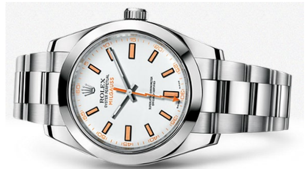
Rolex Milgauss Oyster 40mm Steel Watch (Retail $7,650, GBW3638)