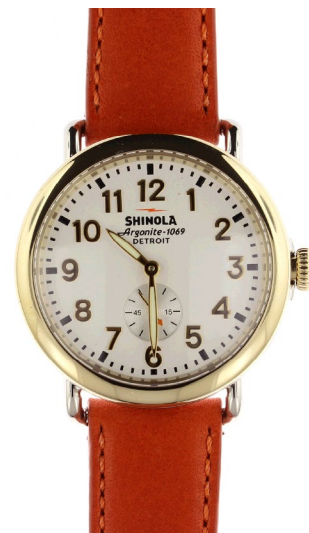
Shinola Runwell Orange Watch (Retail $600, LSW1003)