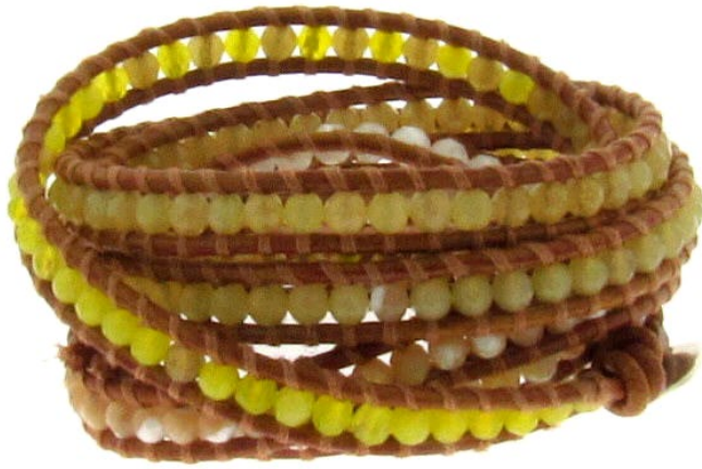
Chan Luu Yellow Mix Henna Bracelet (Retail $200, LSB0079)