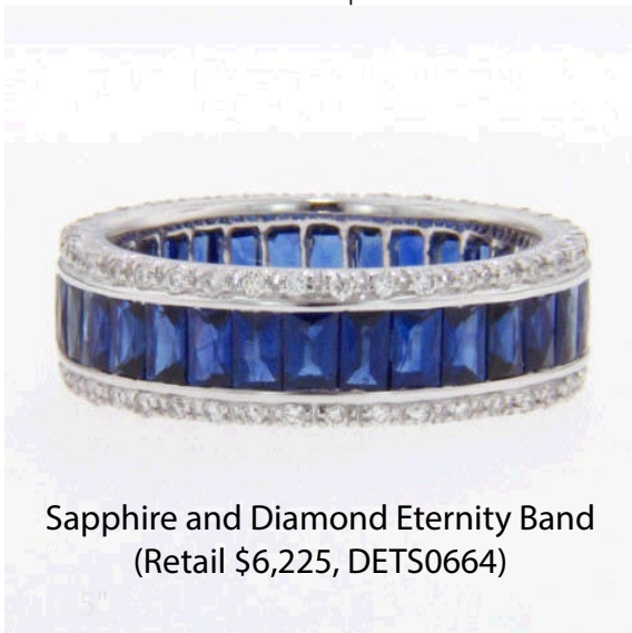
Sapphire and Diamond Eternity Band (Retail $6,225, DETS0664)

Reliable and thoughtful, PANTONE 19-4052 Classic Blue inspires calm, confidence and harmony. Serving as an anchor to the Spring/Summer 2015 palette, Classic Blue is a shade that is strong and reliable. Just as with the sea, because of its waterborne qualities, this Classic Blue is perceived as thoughtful and introspective.