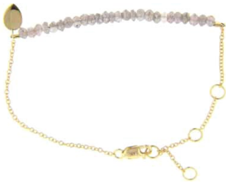
Gold & Labrodorite Bead Bracelet (Retail $300, MSB0159)

More dominant for men than women in Spring/Summer 2015, PANTONE 14-4102 Glacier Gray is an unobtrusive gray that contrasts and enhances; bouncing off other shades without taking away from them as it slips into the background to allow other colors to take center stage. Nature's most perfect neutral, Glacier Gray is a shade that is timeless. Quietly assuring and peacefully relaxing, Glacier Gray, is above all, constant.